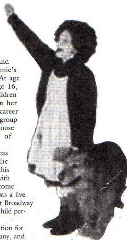
The Random Farms Kids Theater presents 'Annie' at the Tarrytown Music Hall, August 2-5.

Annie will be performed at the Tarrytown Music Hall, 13 Main Street, August 2-5. Performances are Friday at 11am and 7pm; Saturday at 3pm and 7pm; Sunday at 1pm; and Monday at 11am. Tickets are $15; group rates are available. Call the box office for tickets at (914) 682-3707, ext. 10.